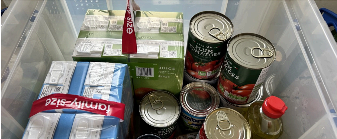
Food parcels provide continuing support

Our Survive & Thrive service continued to support guests who had stayed at Crossways during winter 2022-23, drawing upon our extensive network of community groups.