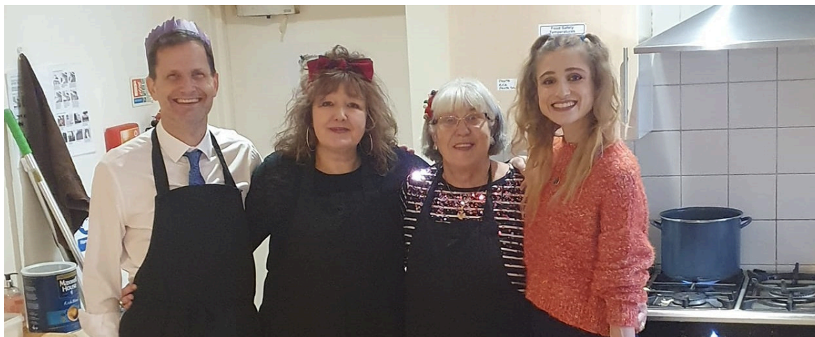
Our amazing volunteers preparing Christmas dinner